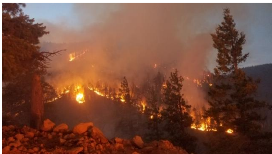
Fire on evening of July 21st, looking north from Oldham Park area on Mt Elden Rd

Burning within the footprint of the Flagstaff Watershed Protection Project (FWPP), the Museum wildfire which began Sun July 21<sup>st</sup> and ultimately burned 1,961 acres in the Dry Lake Hills (DLH) area north of town and cost an estimated $9 million to suppress, was a difficult, challenging, and unfortunate event.