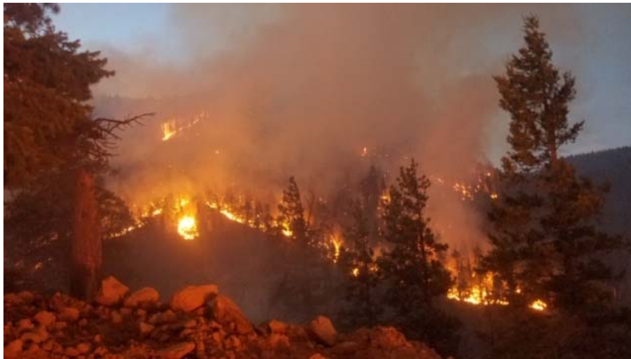
Fire on evening of July 21 st , looking north from Oldham Park area on Mt Elden Rd

Burning within the footprint of the Flagstaff Watershed Protection Project (FWPP), the Museum wildfire which began Sun July 21 st and ultimately burned 1,961 acres in the Dry Lake Hills (DLH) area north of town and cost an estimated $9 million to suppress, was a difficult, challenging, and unfortunate event.